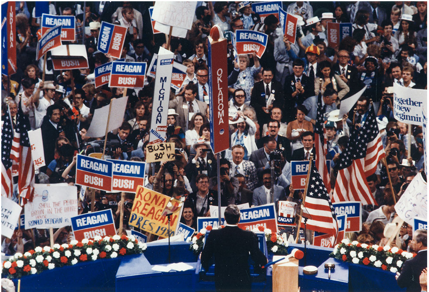
Ronald Reagan gives his acceptance speech as presidential nominee at the Republican National Convention in Detroit on July 17, 1980.